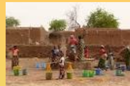
Strengthening the resilience of vulnerable households and communities and managing risks and crisis