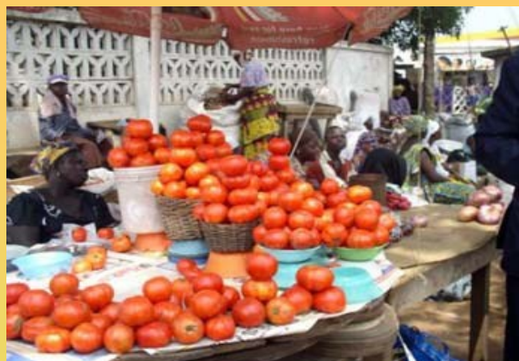
Improving rural infrastructure and trade-related capacity for market access

It also integrates aspects related to climate change and takes into account the specific needs of women and vulnerable groups.