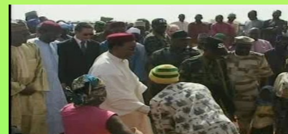
Creating enable environment for sustainable food security and coordinating multi-sector and multi-stakeholder interventions

"To contribute to the protection of the Nigerien people from hunger and to ensure their full participation in national production and the improvement of their income."