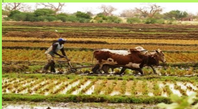
Increasing and diversifying agriculture production

The 3N Initiative is a multisectoral strategy focused on households, communities, and country resilience to food security. It is articulated around public-private partnership and civil society organizations to accelerate the development of a sustainable agriculture.